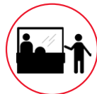
EXHIBIT BOOTHS AND BADGES

TO MEET THE DEMANDS OF GROWING PHYSICIAN ATTENDANCE, CiDA 2019 WILL OFFER A GREATER NUMBER OF MARKETING OPPORTUNITIES THAN EVER BEFORE.