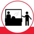
EXHIBIT BOOTHS AND BADGES

The promotional opportunities available to CiDA Exhibitors are designed to address a wide range of business goals, and accommodate budgets of all sizes. Please contact us at exhibitsales@ccmcm.com to discuss your company's CiDA strategy further.